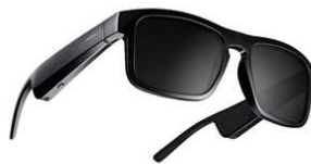
BLUETOOTH AUDIO SUNGLASSES