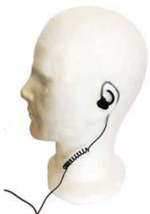
BONE CONDUCTION INTRA-EAR